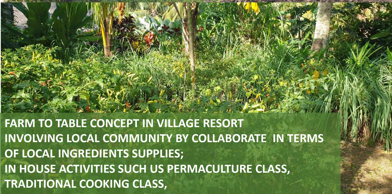
FARM TO TABLE CONCEPT IN VILLAGE RESORT INVOLVING LOCAL COMMUNITY BY COLLABORATE IN TERMS OF LOCAL INGREDIENTS SUPPLIES; IN HOUSE ACTIVITIES SUCH US PERMACULTURE CLASS, TRADITIONAL COOKING CLASS,