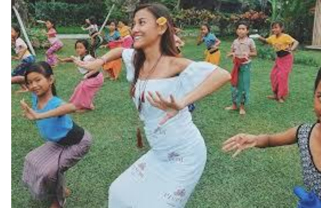
DANCING CLASS TOGETHER WITH LOCAL COMMUNITY CHILDREN