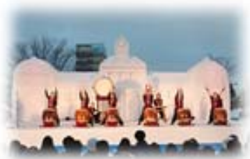
Yamagata Snow Festival