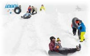
Yamagata Snow Festival