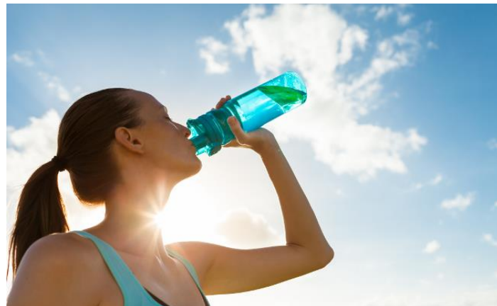
Health & wellness