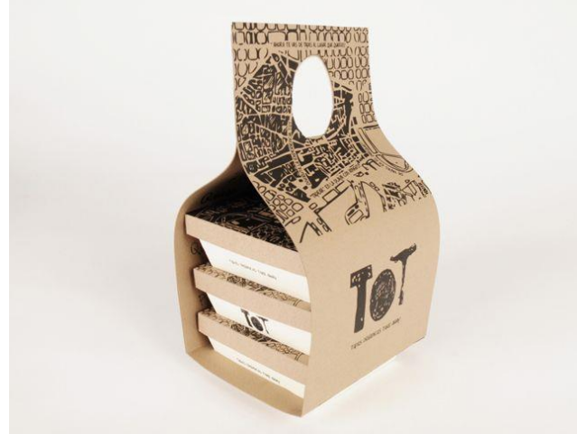
Environment & sustainability