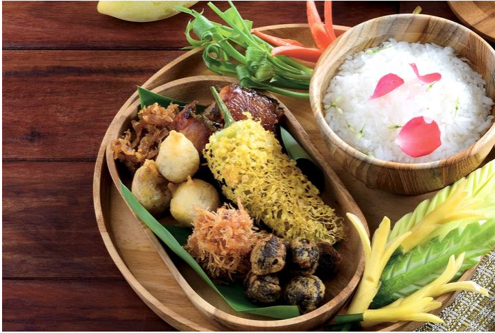
Culture & Tradition