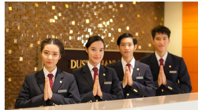
People with the right mindsets