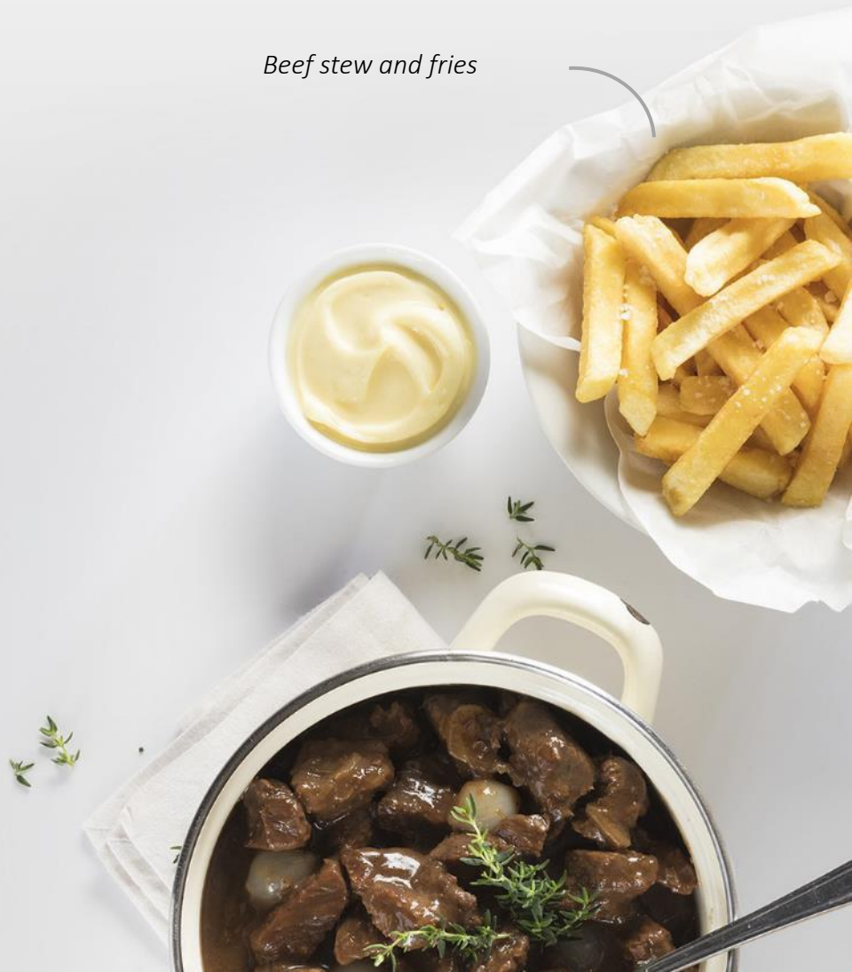
Beef stew and fries