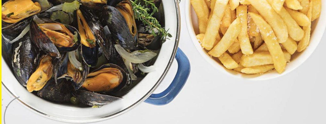
Mussels and fries