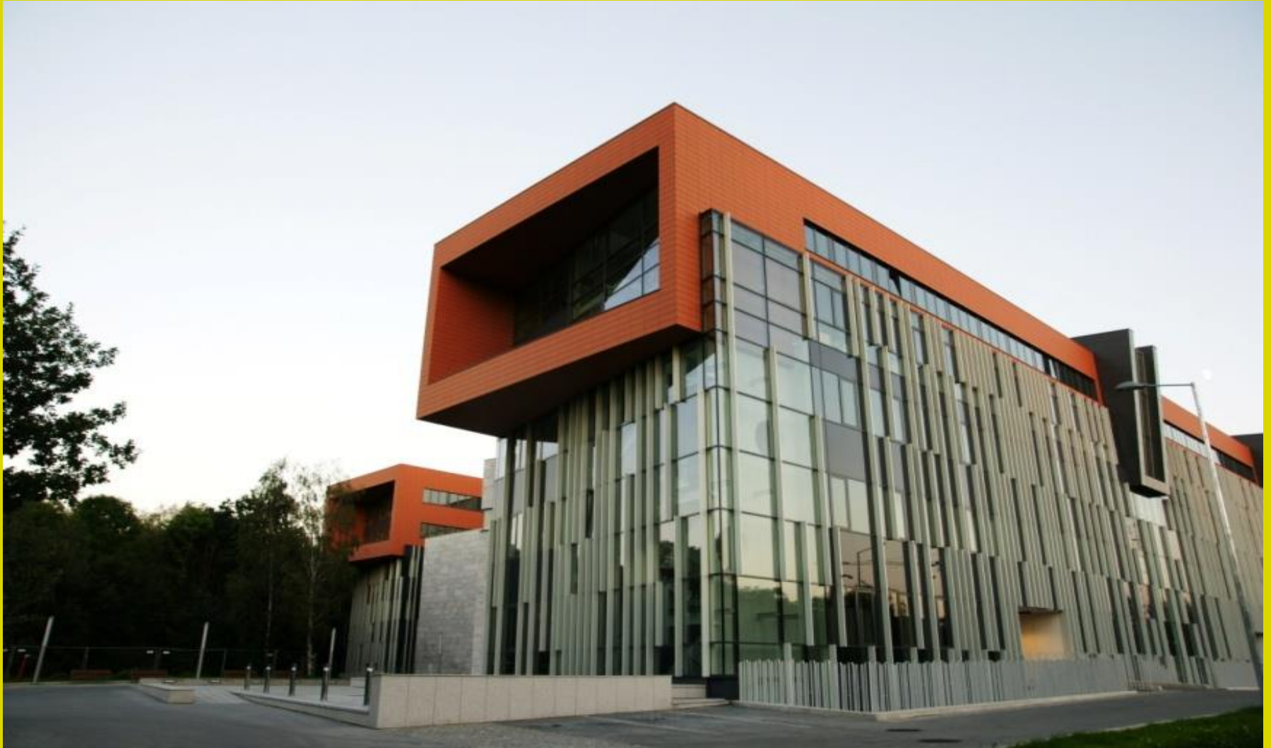
University of Lodz - New Faculty of Philology