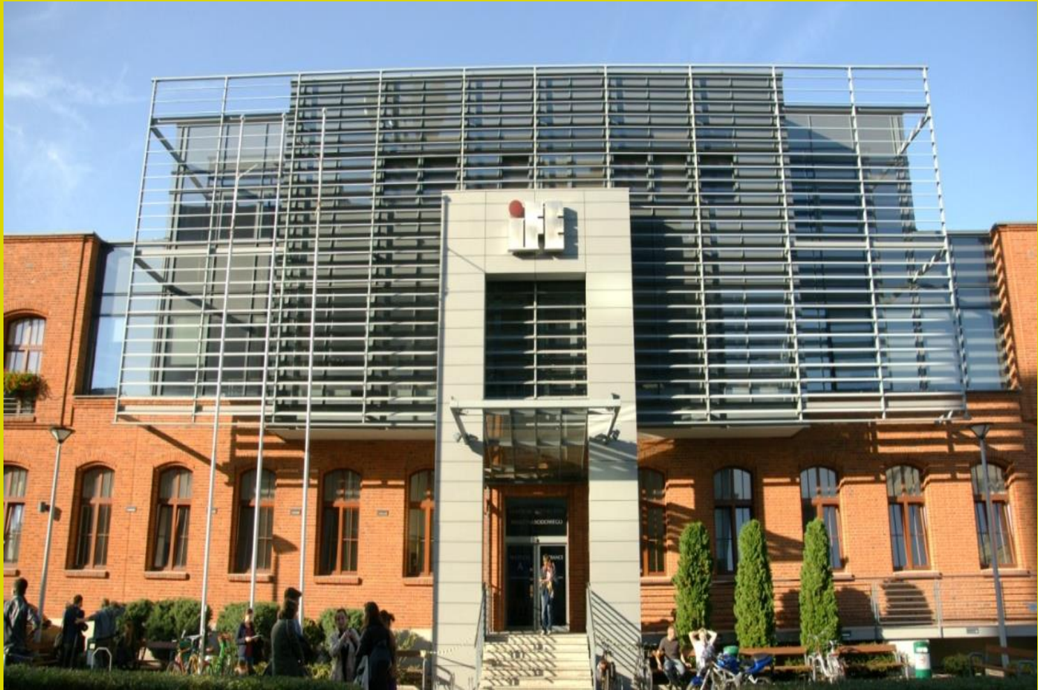
IFE — main entrance to the building