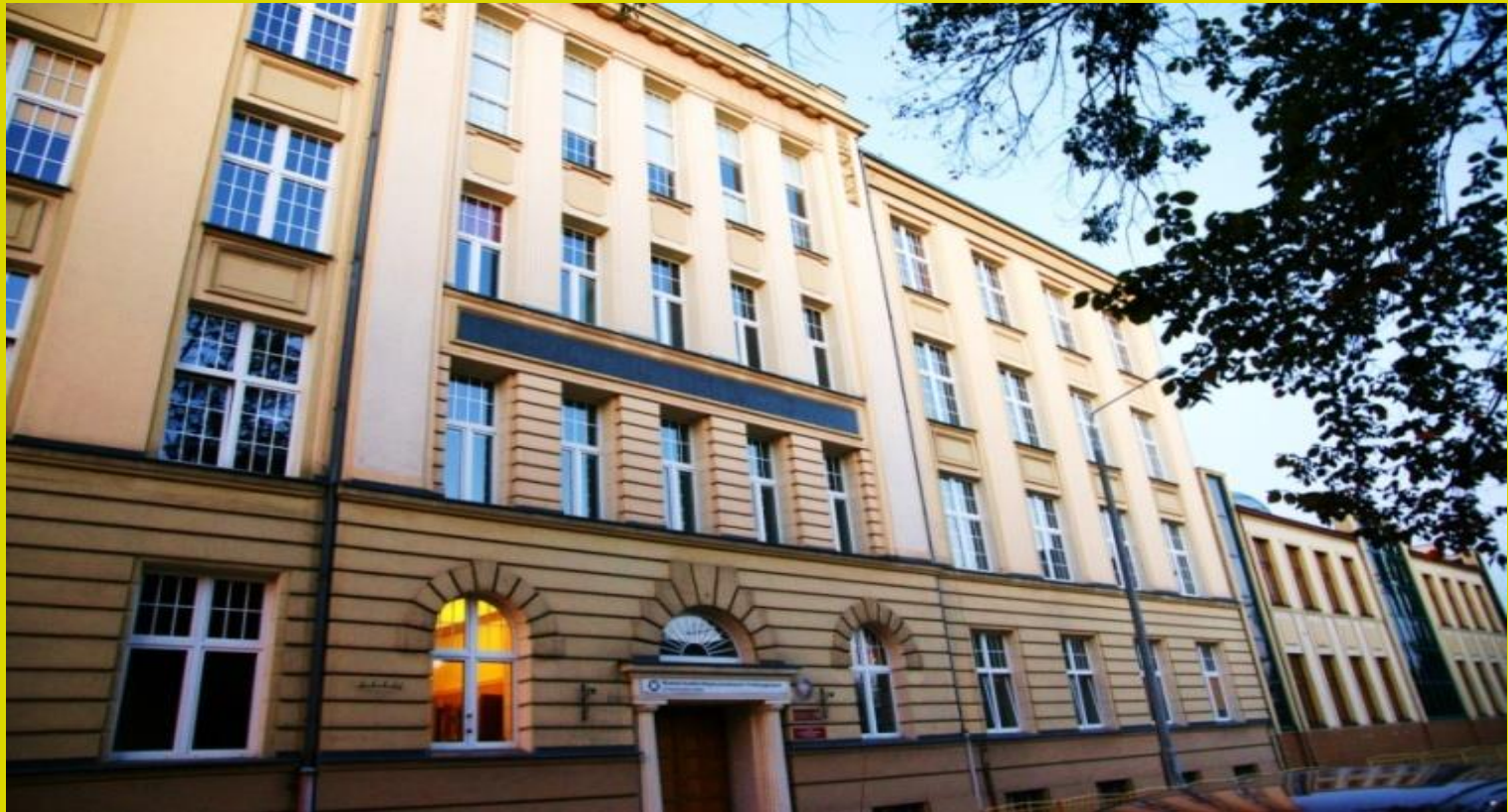
Faculty of International and Political Studies of the University of Lodz