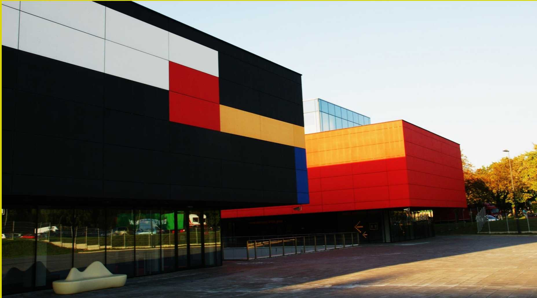
Academy of Fine Arts in Lodz „Textile and Clothing industry cluster”