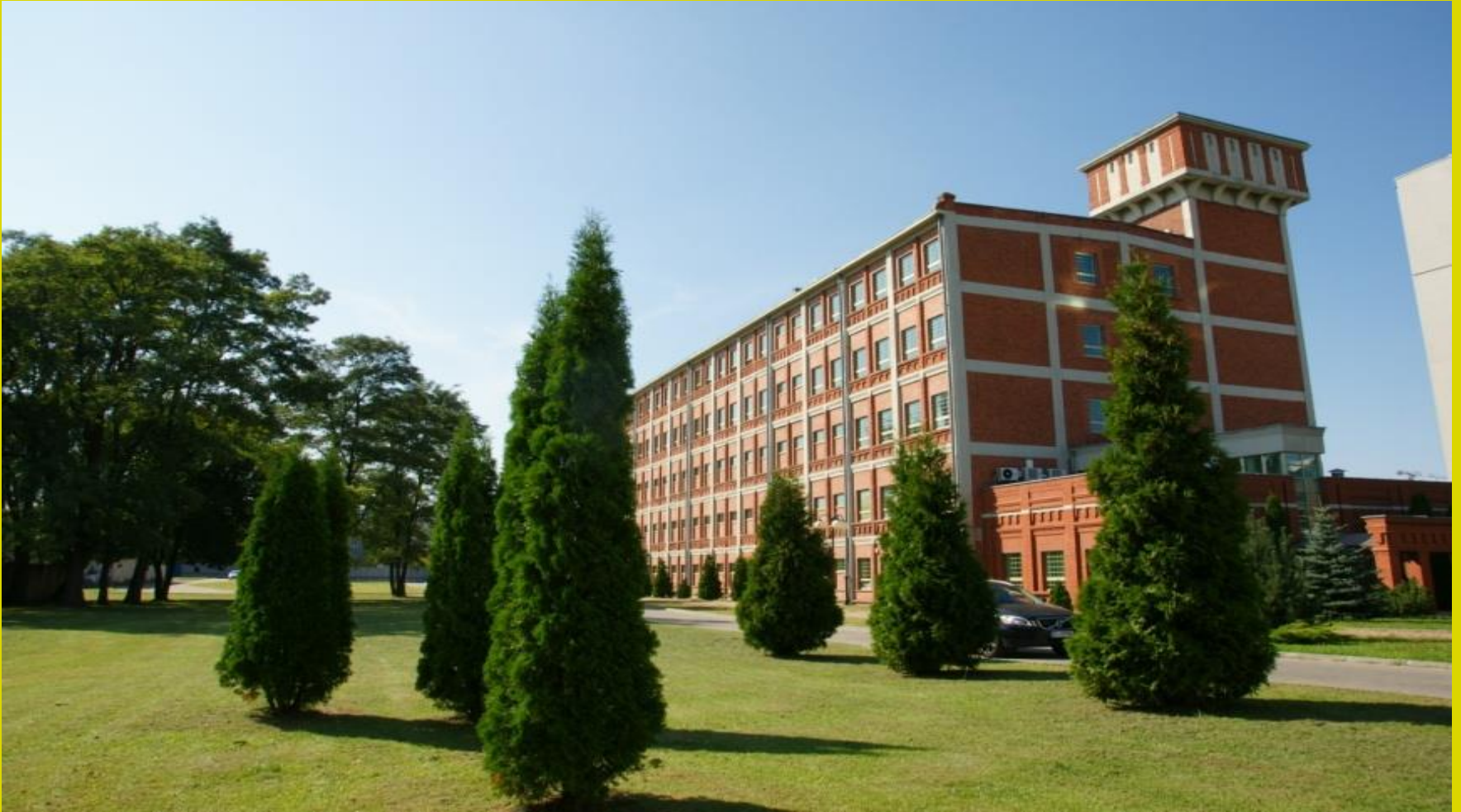
Central Library of the Lodz University of Technology (former factory warehouse of 1912)