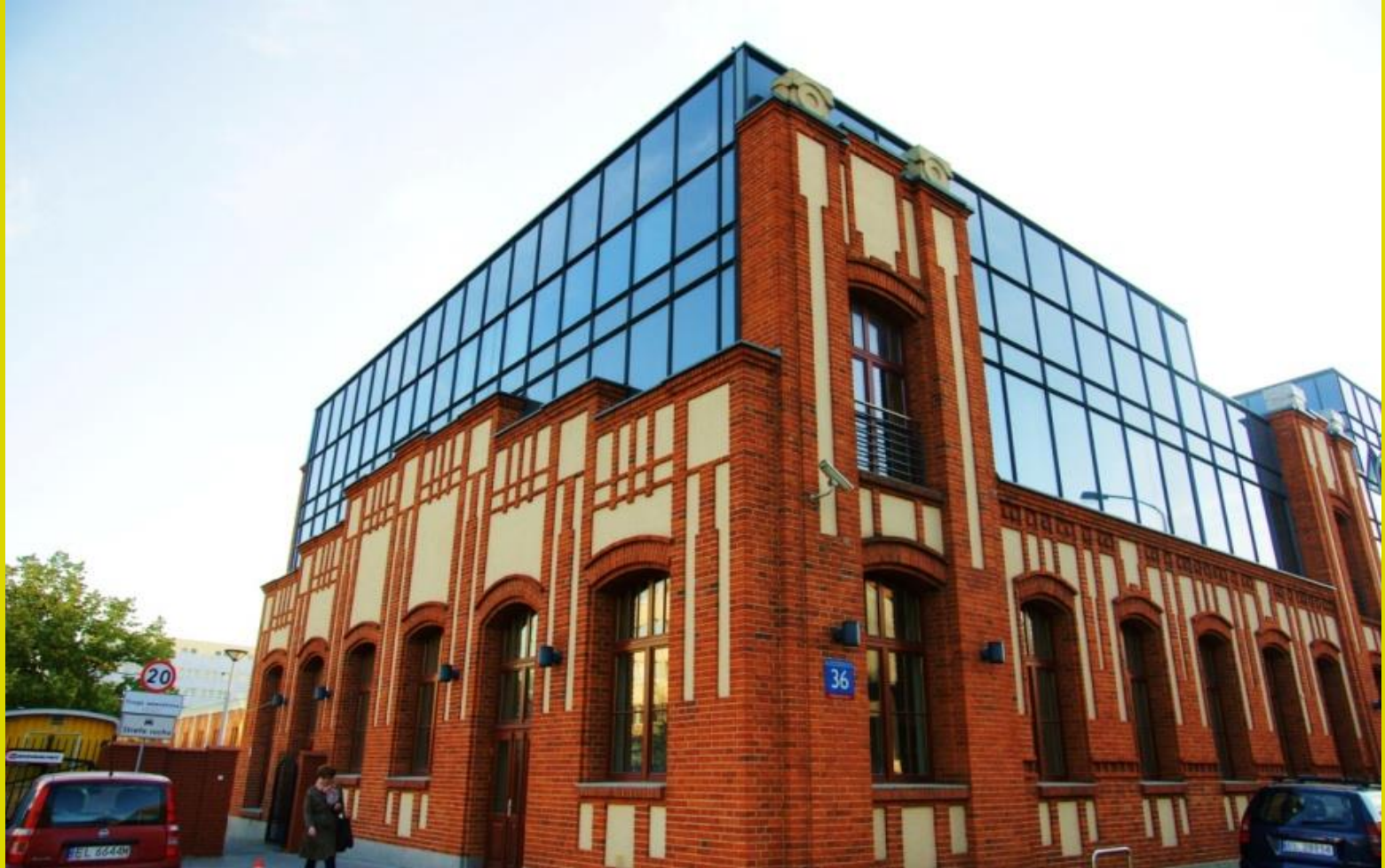
International Faculty of Engineering (IFE)