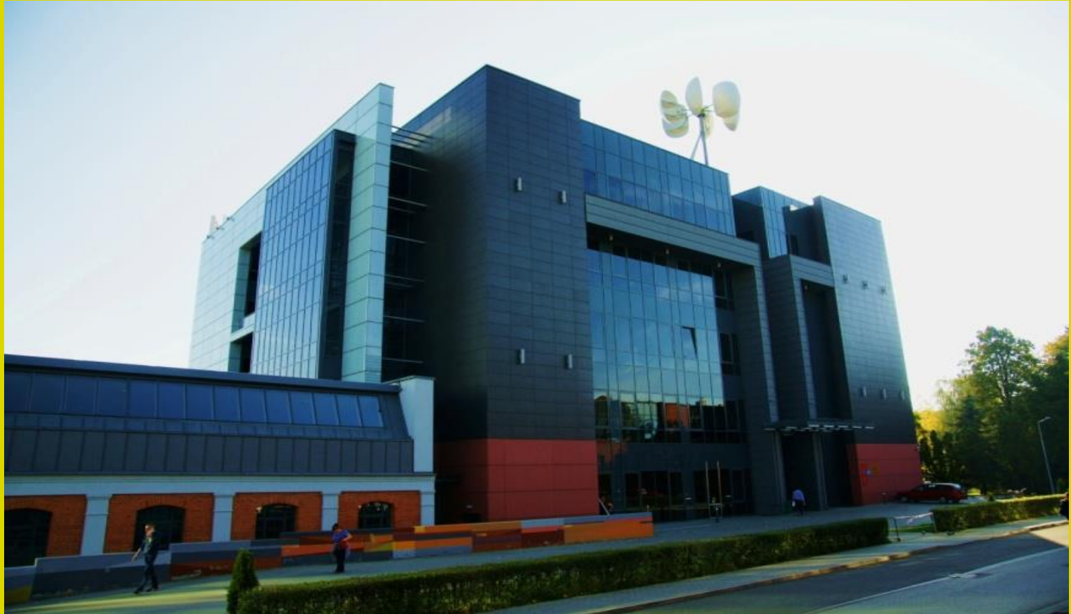
Building of the „Factory of 21st Century Engineers” at the Lodz University of Technology