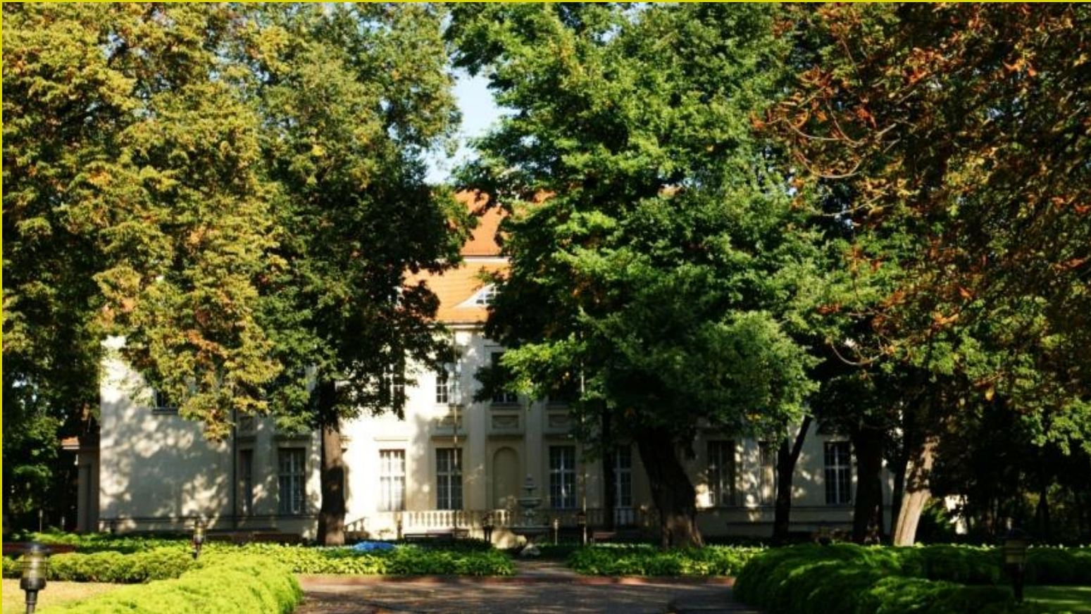
Biedermann's palace owned by the University of Lodz

Positive image of universities contributes to the positive image of Lodz as an attractive place to study.