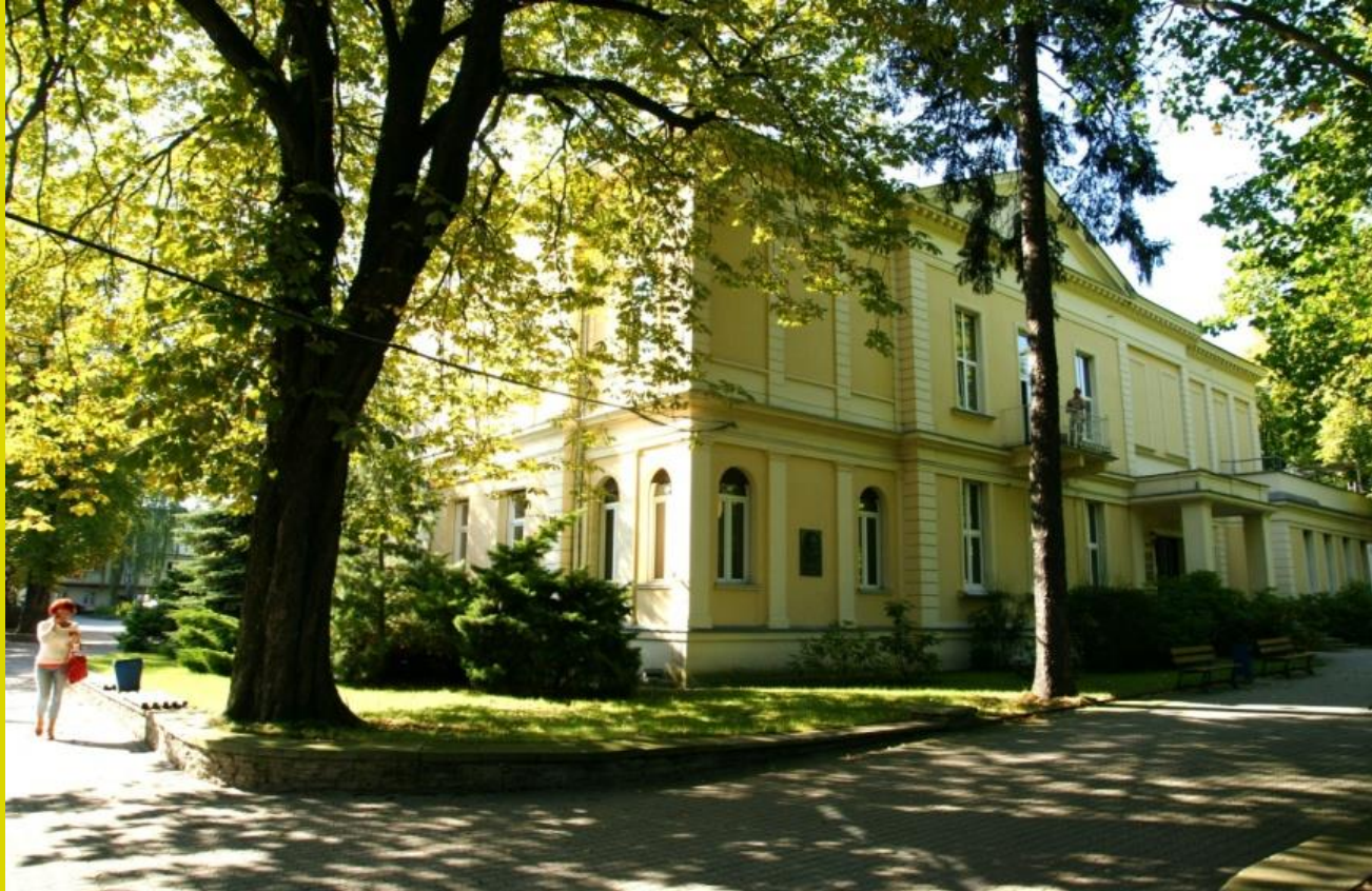
Park surrounding the Principal's office of the Lodz Film School