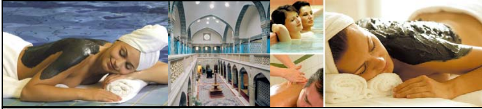
CAPACITY BUILDING PROGRAMME ON TOURISM STATISTICS, Regional Seminar, Vienna (Austria), 1 st July 2009