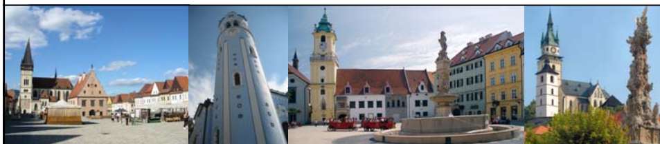
CAPACITY BUILDING PROGRAMME ON TOURISM STATISTICS, Regional Seminar, Vienna (Austria), 1 st July 2009