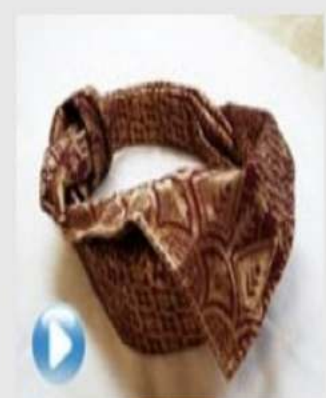
Watch: Tanjak Making in Pekan